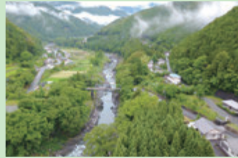
4 "Sato-yama" rural area