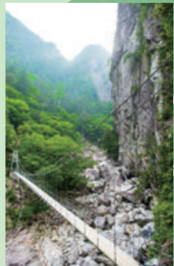
6 The Osugidani Valley