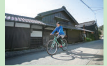
1 Kumano Kodo Pilgrimage Trail