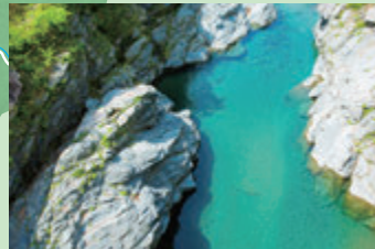
5 Miyagawa River