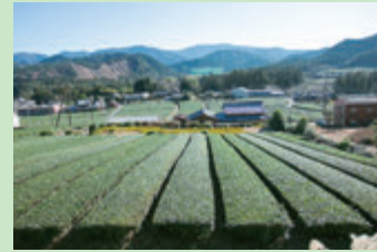
2 Tea field